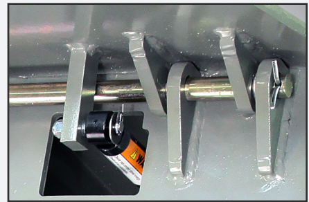
"Box construction" deck with a heavy duty lug hinge design.