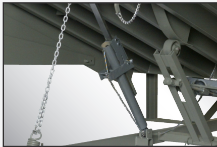
Heavy-duty, extended range, float barrel hold-down mechanism.