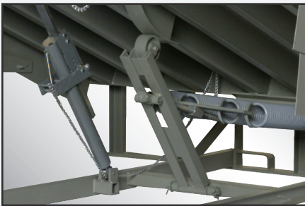
Cam Control Counter Balance Assembly permits smooth ramp extension and easy walk-down of the leveler.