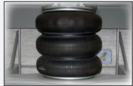
Steel belted rubber bellows system uses compressed air to raise platform.