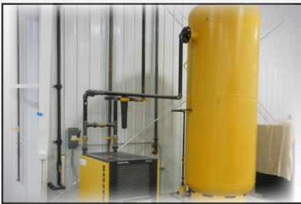
Simply connect the CA to existing plant air or a centralized compressor.